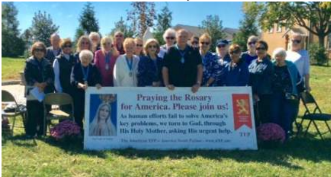
Rosary Rally 2022

Please join our parish as well as thousands of Catholics, to publicly pray the Rosary during this annual event. Mary asked us at Fatima to pray the Rosary daily for peace in our world and peace in our families. All are welcome as we publicly pray the Rosary at the Blessed Mother statue for our community to witness our faith.